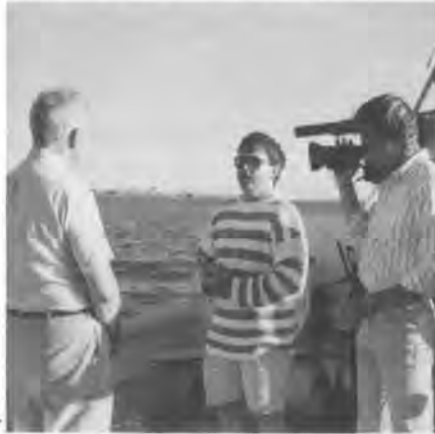
Stevens Productions videotaping on Long Island Sound

Several years ago, Stevens Productions produced the video, "How Sound is Long Island Sound?", which was broadcast on public TV's