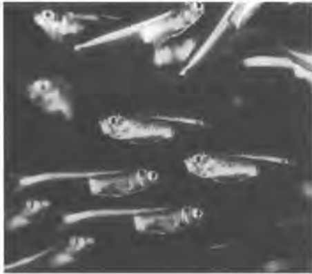
Silversides used in fisheries biologist David Conover's research